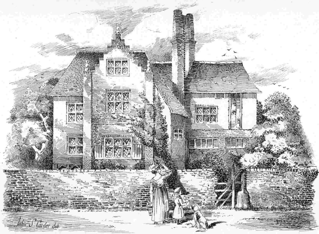
OLD HOUSE AT ASHBOCKING.