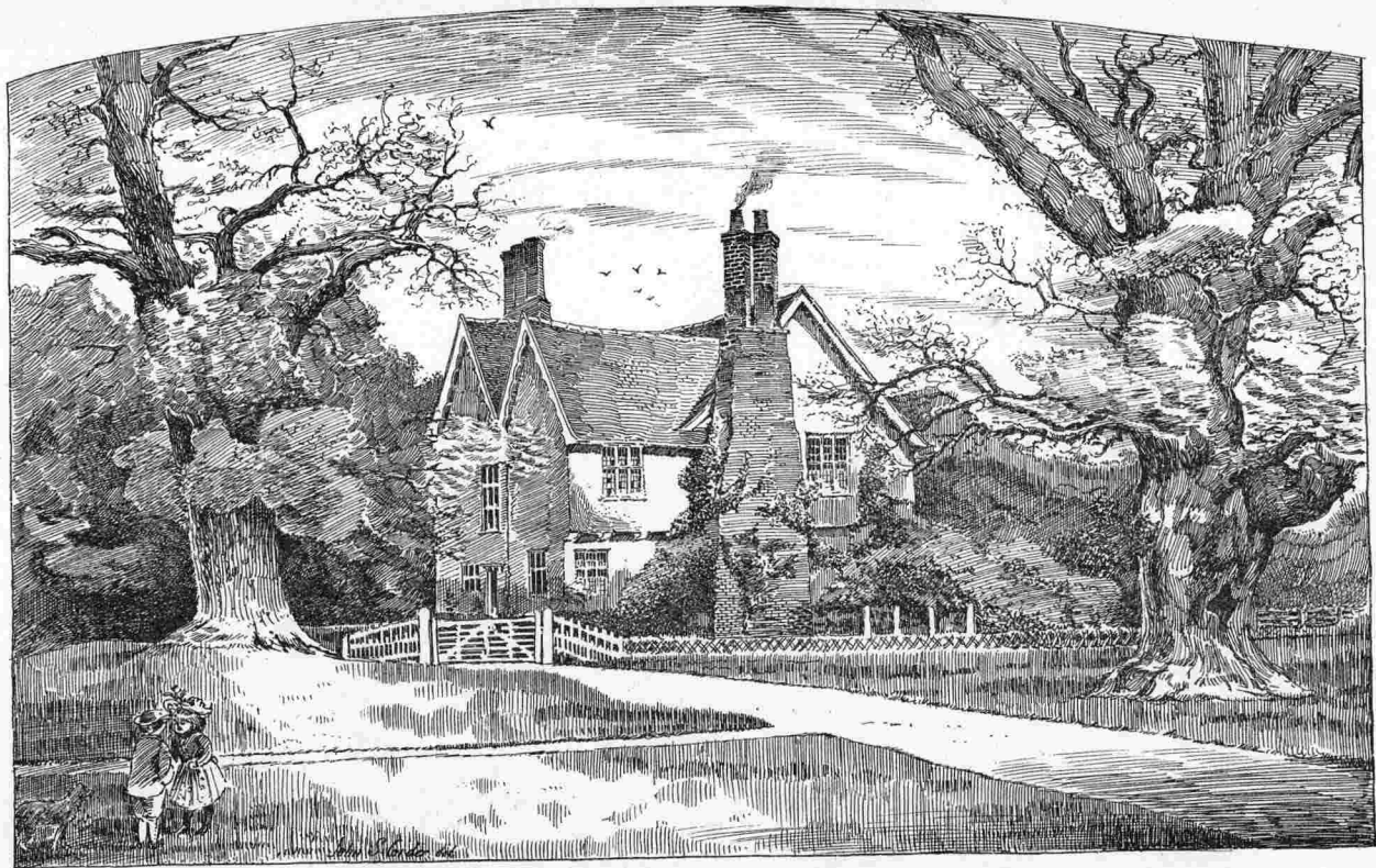
ASHBOCKING OLD HALL.